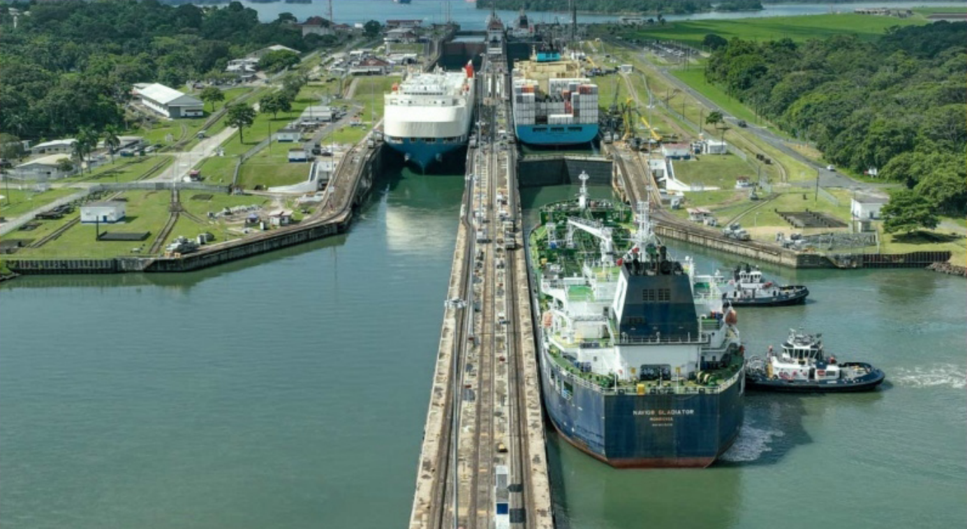
Panama Canal, a maritime corridor used by criminal networks to move drug shipments.