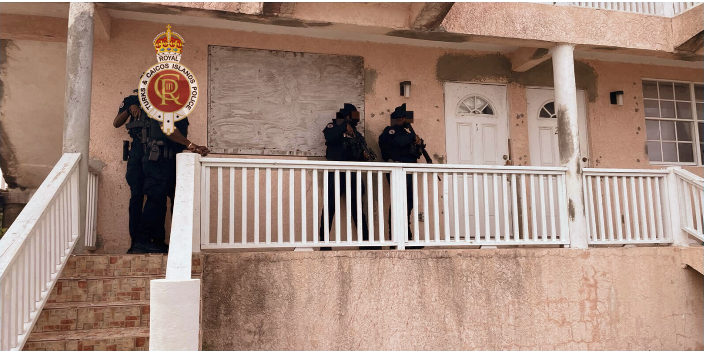
Serious Crime Unit detectives of the Royal Turks and Caicos Islands Police Force conduct a raid.