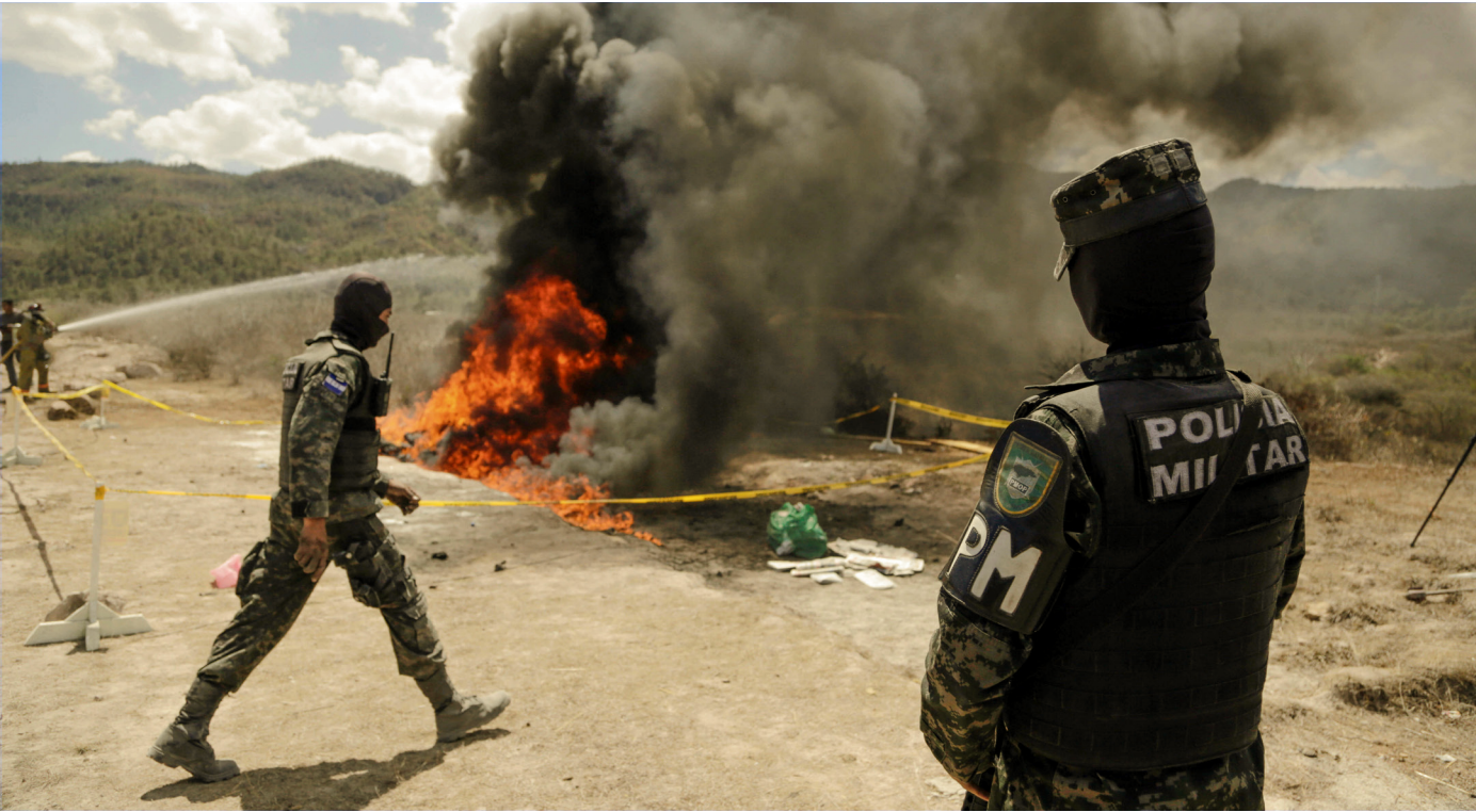
Authorities burn seized cocaine in Honduras.