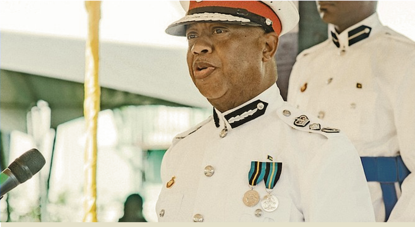
Police Commissioner Clayton Fernander shares strategies to tackle gun violence in the country.