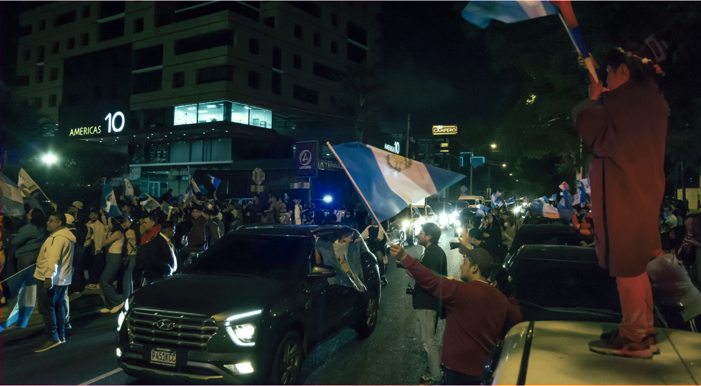
Jubilant Guatemalans take to the streets to celebrate Bernardo Arévalo's victory in the 2023 presidential elections, Guatemala City, Guatemala.