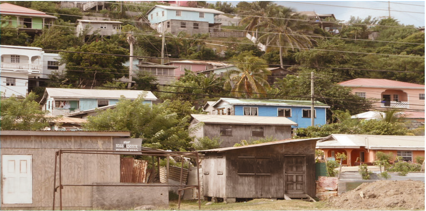
The town of Vieux Fort, one of the main hotspots of gang activity in St. Lucia.