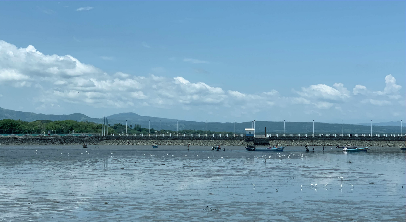
Port of La Unión, routinely used by cocaine smugglers moving drugs north in boats and submarines.