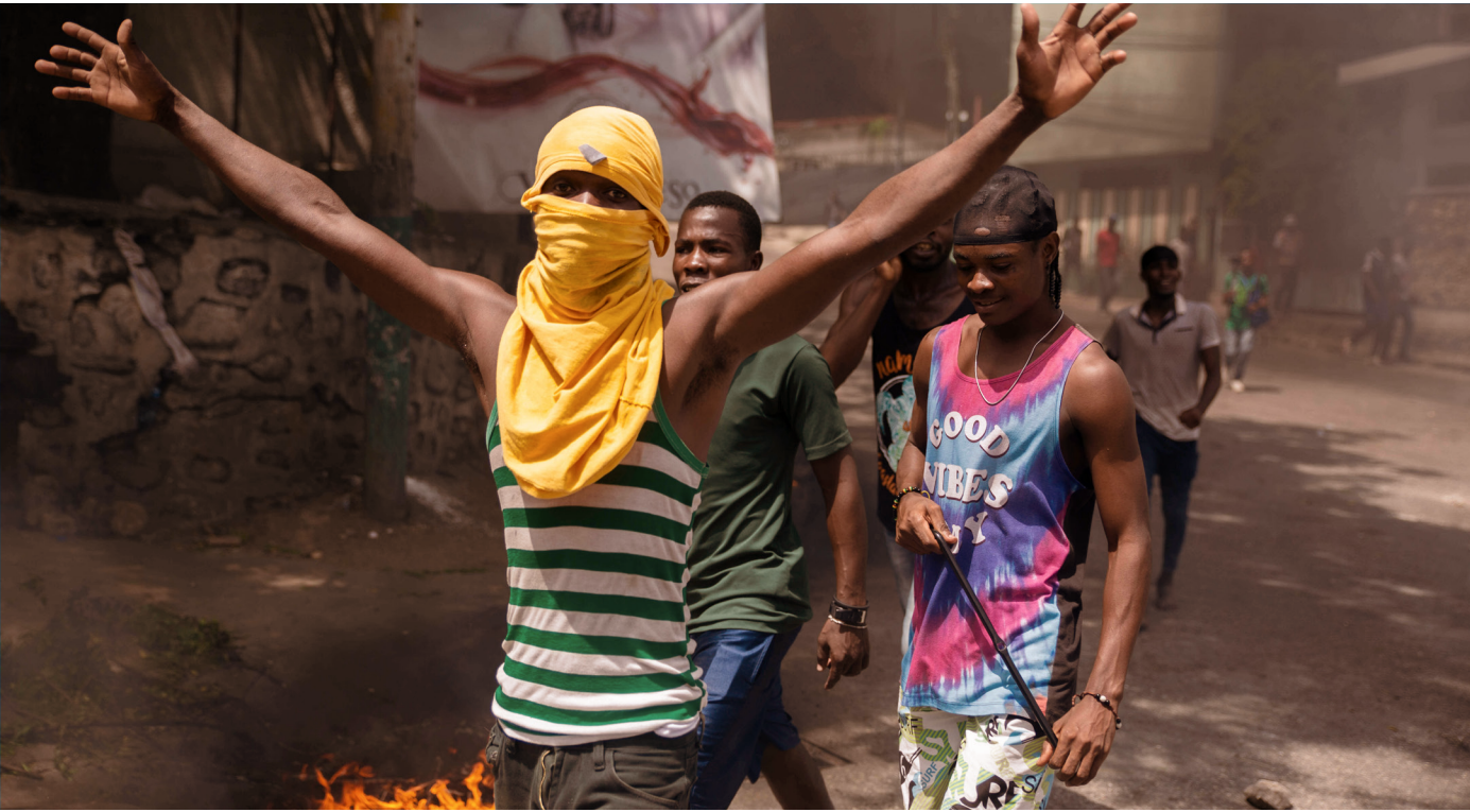
Haitians protest the assassination of President Jovenel Moïse.