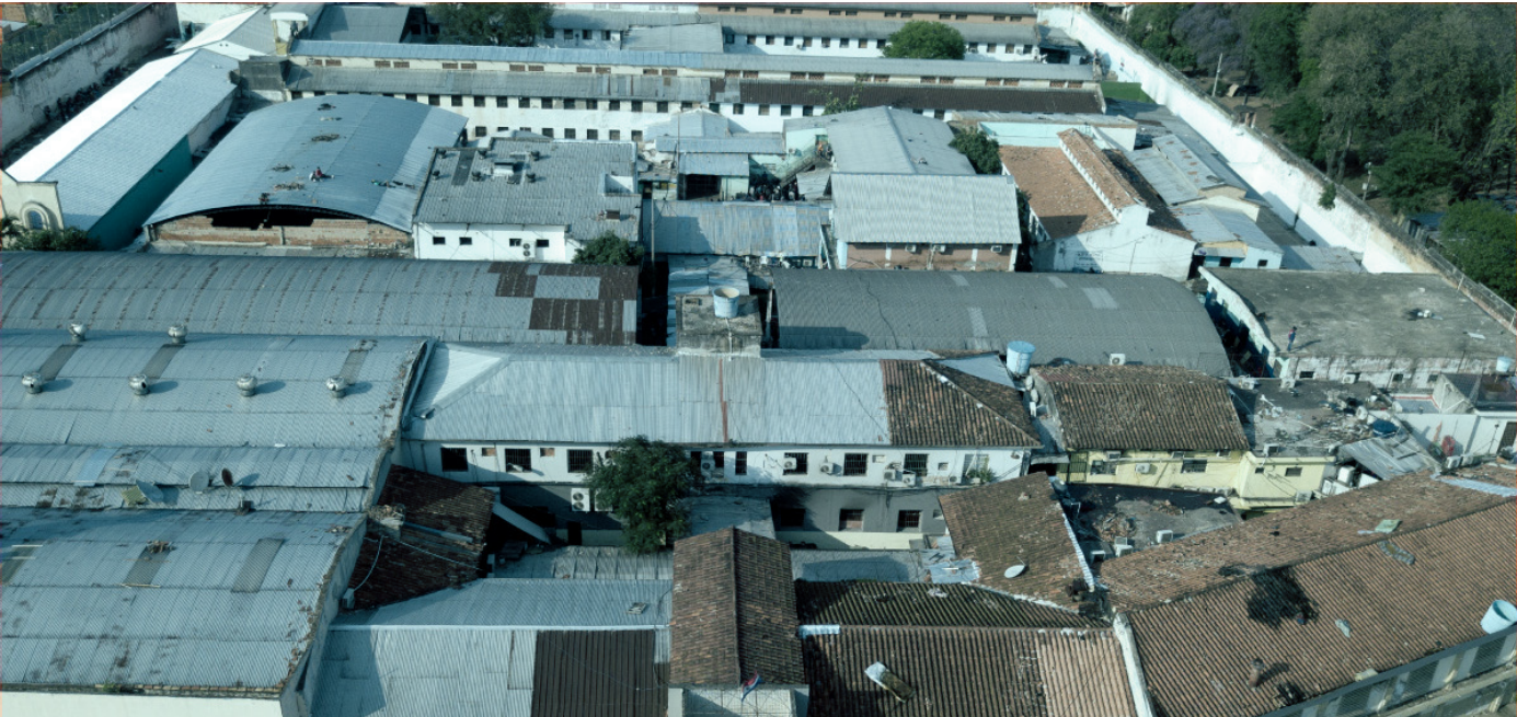
Tacumbú Prison, in Asunción, battlefield between the Rotela Clan and its main rival, the PCC.