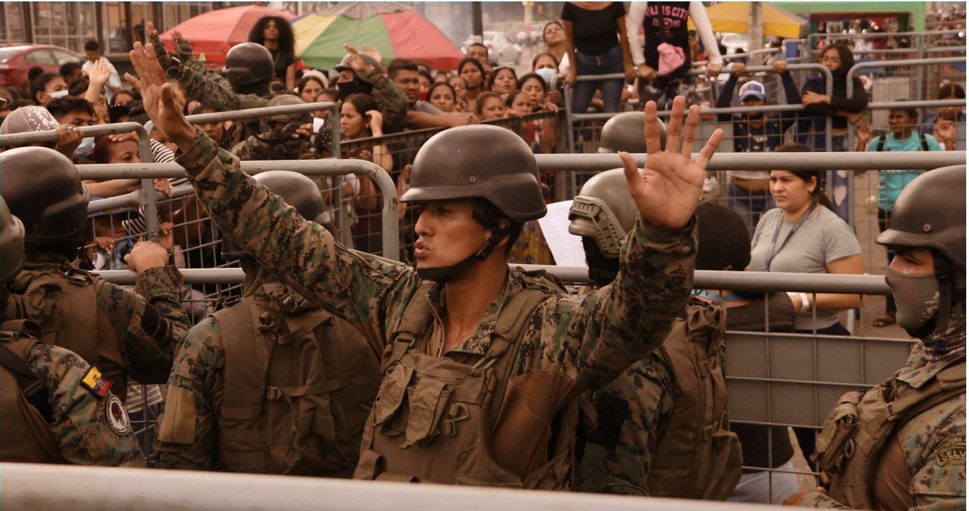
Soldier asks for calm after deadly clashes in a prison.