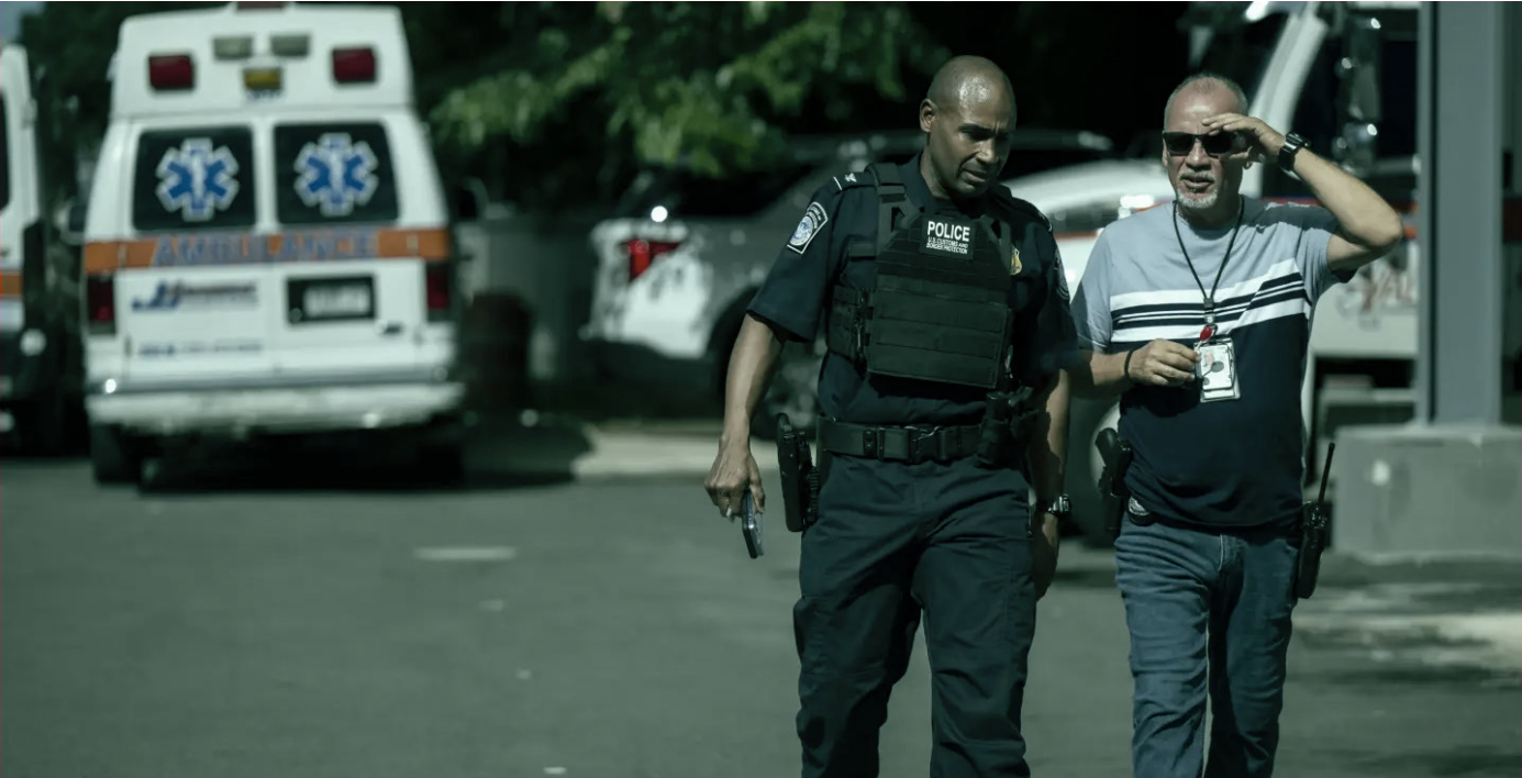
Federal agents outside Rio Piedras Medical Center in San Juan await updates on injured colleagues rescued from Cabo Rojo, a key cocaine smuggling route from South America.