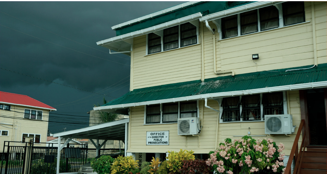
Guyana's Public Prosecutor's Office.