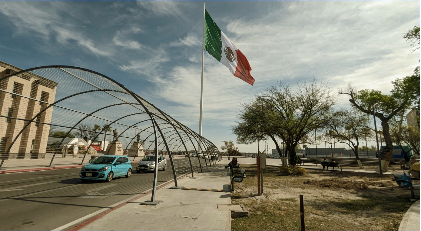
Border crossing between the city of Piedras Negras, in Coahuila, and Eagle Pass, in Texas.