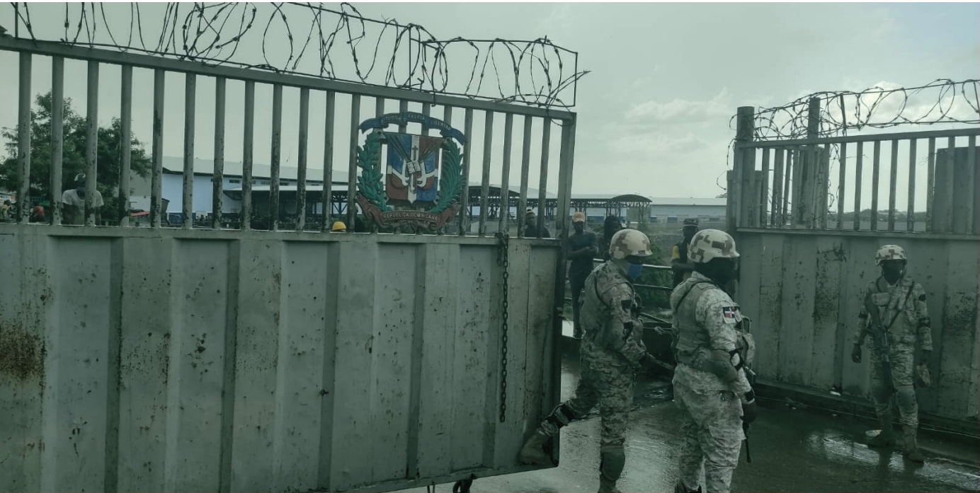
Specialized Land Border Security Corps (Cuerpo Especializado de Seguridad Fronteriza - CESFRONT) officers at the Dajabón bridge, on the border with Haiti.