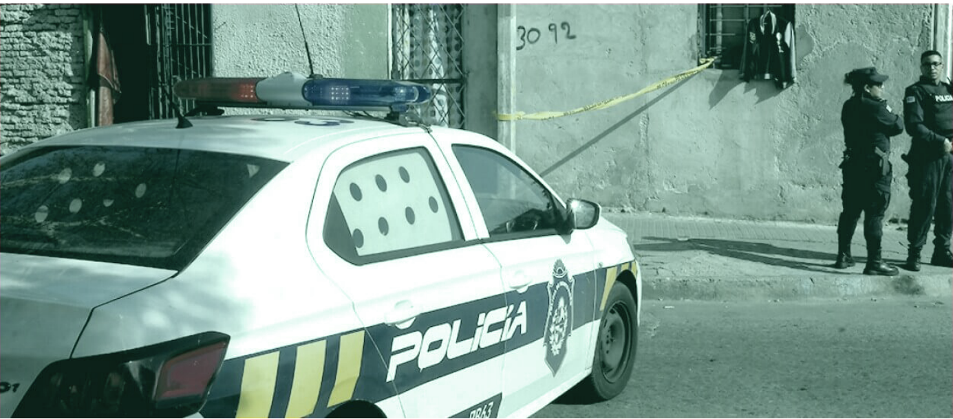
Authorities carry out a police operation in the Villa Española neighborhood, in Montevideo, epicenter of homicides in Uruguay in 2023.