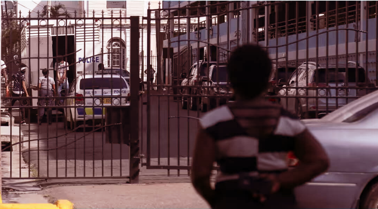
A woman watches as alleged gang members step out of a police truck after arriving at court, in Kingston, Jamaica.