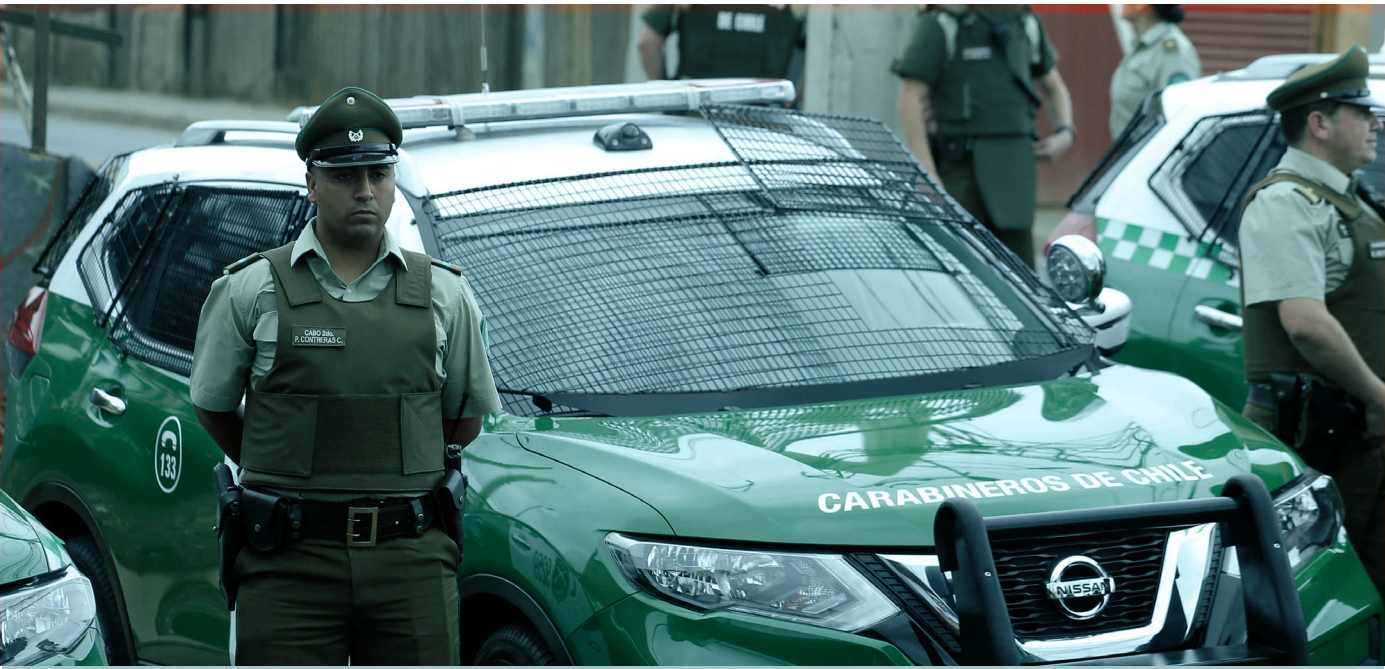
Police officers patrolling as part of Chile's "Streets Without Violence" plan to combat crime.