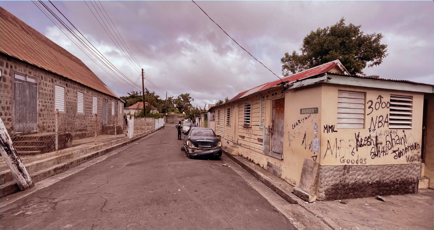
Neighborhood with gang presence in St. Kitts and Nevis.