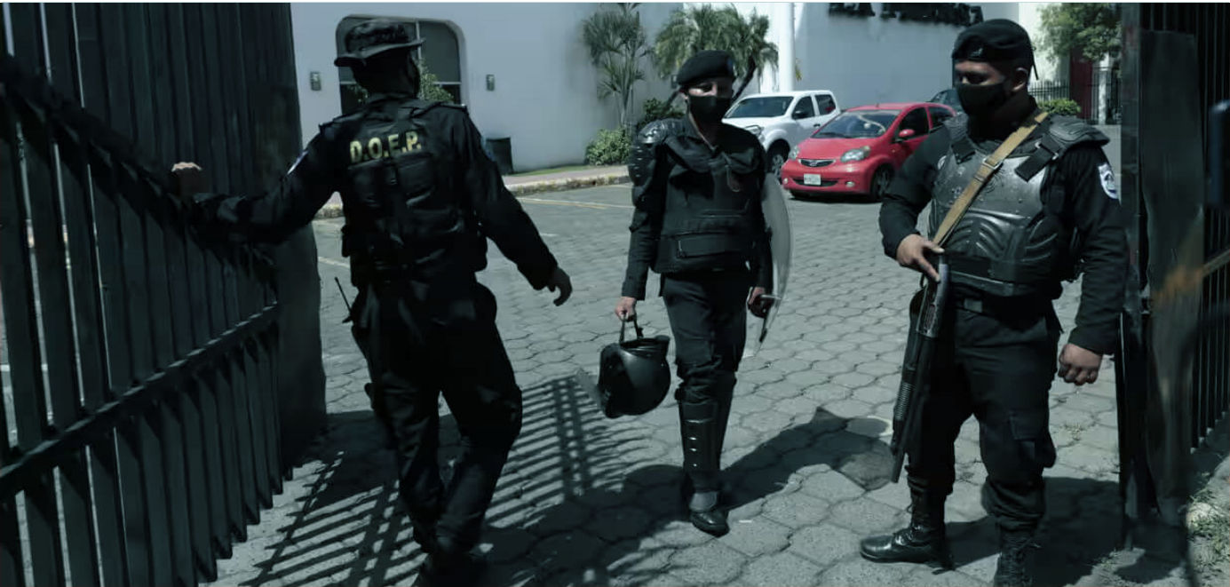
Police at the facilities of the newspaper, La Prensa, in Managua, one of the media outlets that has been attacked multiple times by Daniel Ortega's regime.