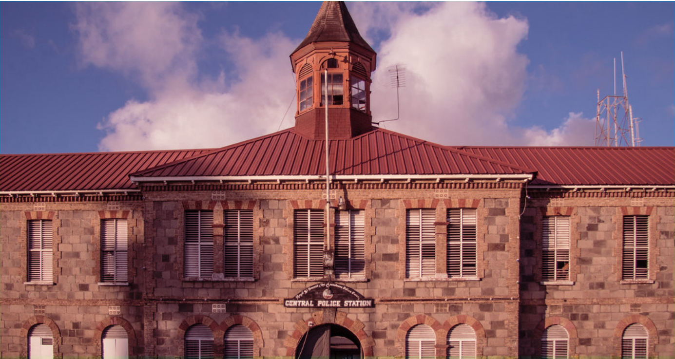
Central police station in Kingstown, St. Vincent.