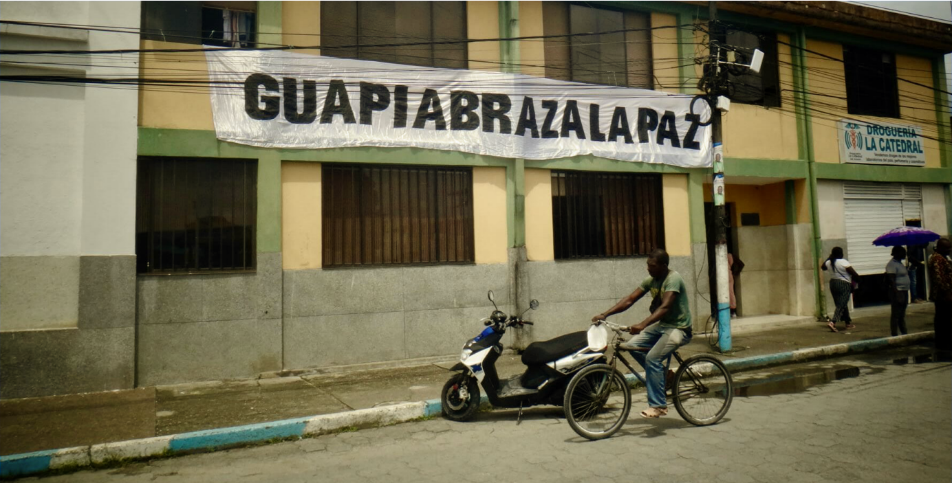
Peace banner in the town of Guapi, Cauca, an area historically affected by armed conflict.