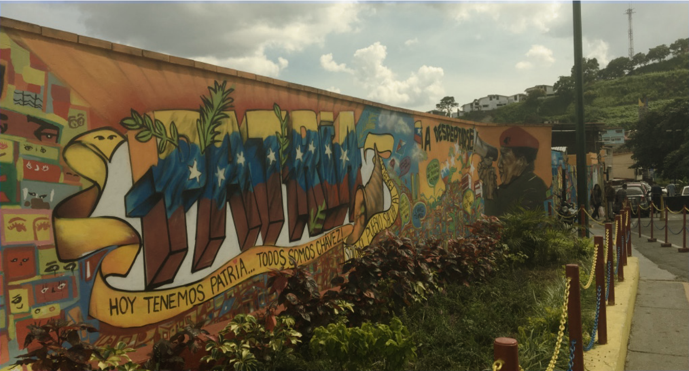
Graffiti outside the Military History Museum in Caracas.