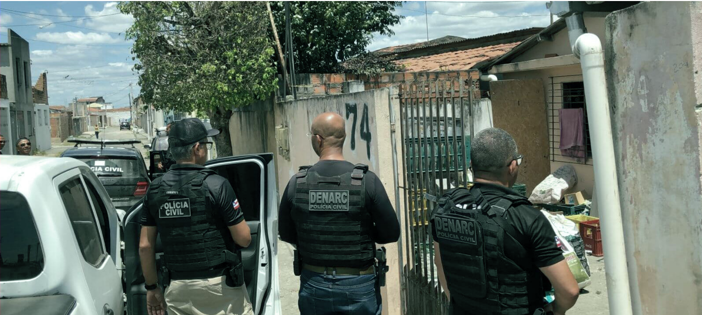
Authorities carry out an operation in the state of Bahia, one of the most lethal areas in Brazil in 2023.