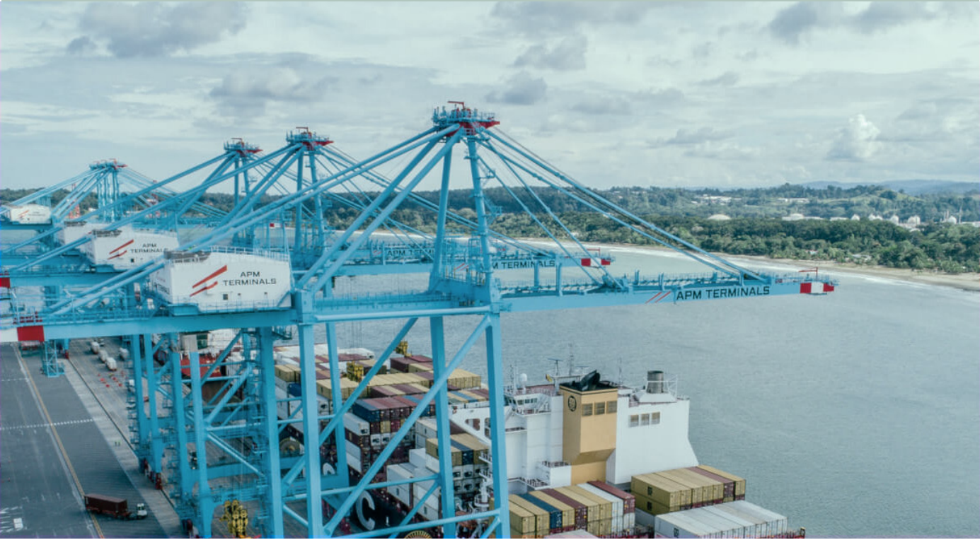
Port of Moín, a key hub for cocaine transport to Europe in the city of Limón.