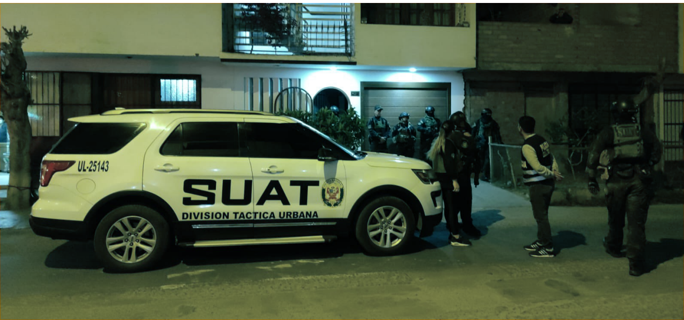
Police officers carry out an operation against Tren de Aragua in Lima.