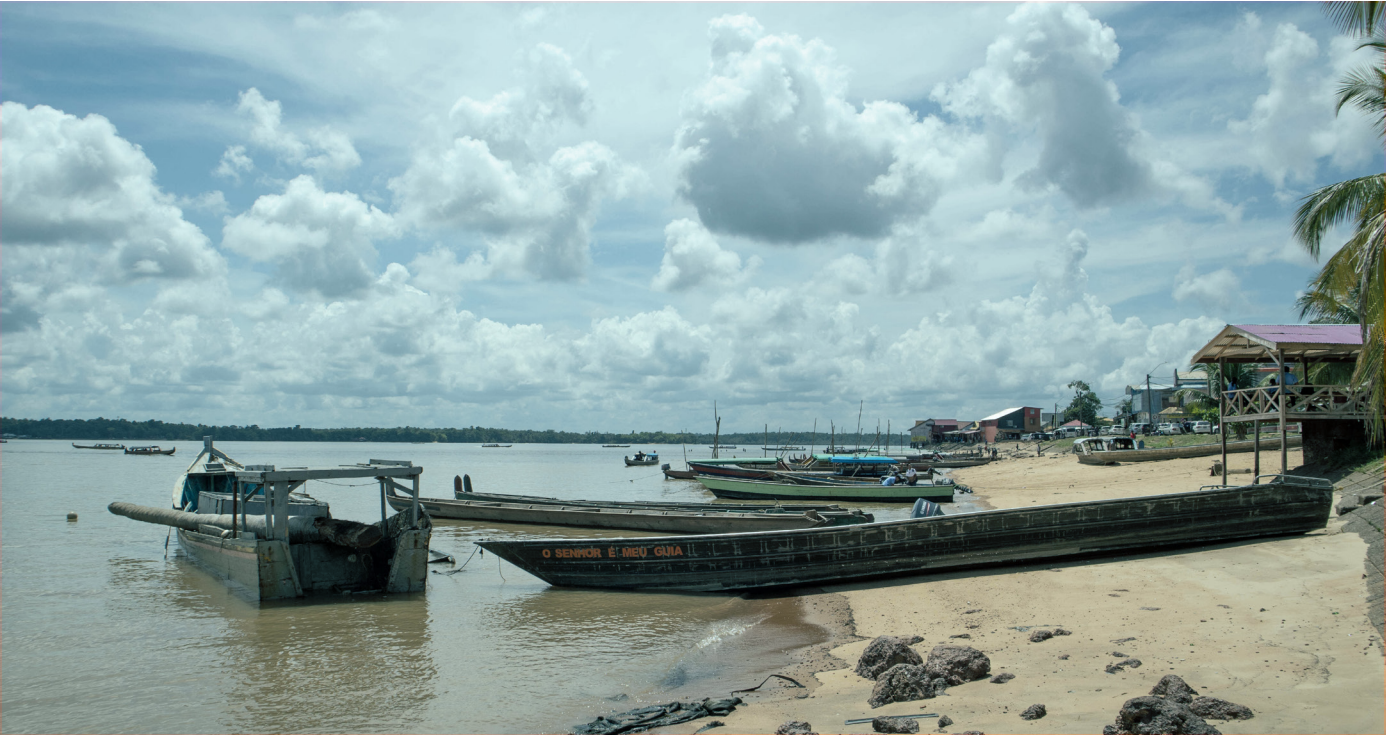
Suriname's border with French Guiana, where smuggling is rampant.