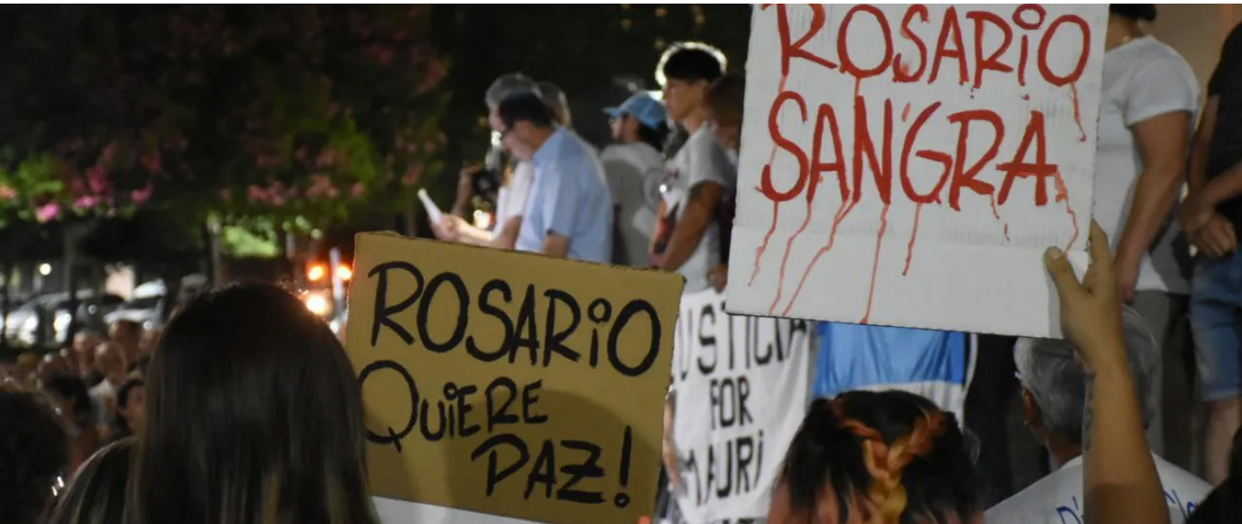
March to demand security in Rosario, a violent hotspot in Argentina.