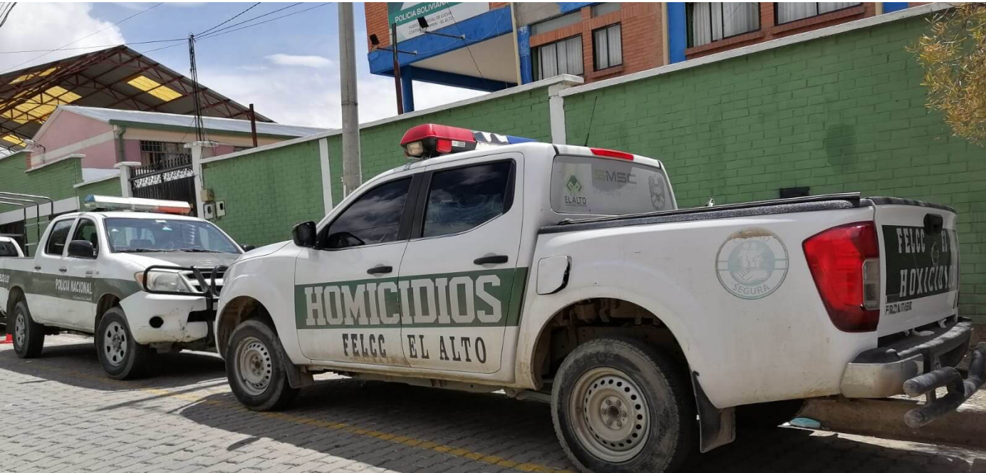
Special Force to Fight Crime (FELCC) facilities in El Alto.